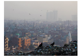
Dust and smoke covered New Delhi in Oct 2014. Pollution levels are among the highest in the world.

DR DAS will continue to support this program. Currently we are enhancing Ultimate protocols for interfacing with the BAM 1020 Report Back Panel including auto recovery of missed data from the BAM’s internal logger. Diagnostics will be recorded to assist in data validation.